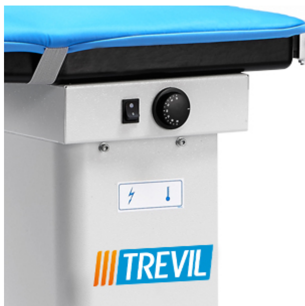
Adjustment of surface temperature